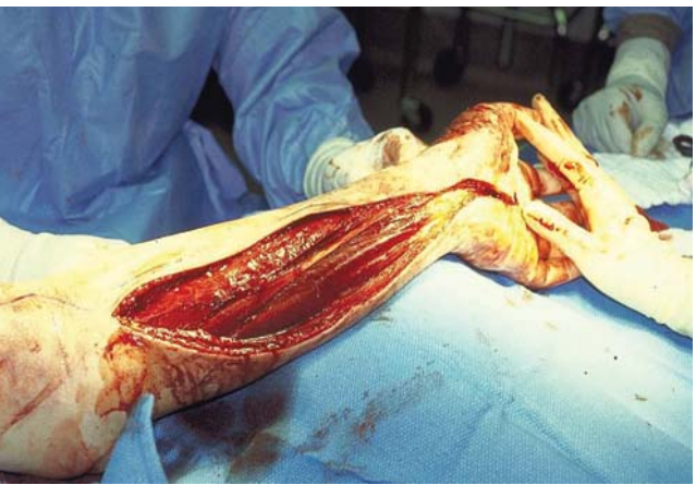
Fasciotomy after bite from a captive Crotalus oreganus hel leri . Figure 2. Intracompartmental pressure is measured in the arm. Figure 3. Intraoperative view of fasciotomy. Fig ure 4. Three years post-bite after skin grafts and muscle transfer.

Consider the ethical justifications in a medical profession already determined to use surgery for other reasons (e.g., to prevent or relieve a suspected "compartment syndrome"; but see below). An averred "muscle necrosis" expiates the damage caused by surgery, and supports the importance of surgery as a valid means of resolving an always uncertain condition. A diagnosed "muscle necrosis" can always be dragged out after the fact even though the surgery itself may have encouraged its development. It is not unexpected that inaccurate or misleading medical reports should find their way into the medical statistics, giving the impression that myonecrosis is rather more common in snakebite than it actually is. Sadly, this may have resulted in many unnecessary surgeries, keeping this expensive and damaging procedure in use as a standard practice. Ultimately, however, the debate over muscle necrosis is less important than the radical methods chosen to deal with it, and vitally, the time-period during when these selected methods are applied. It is this critical time-period that will