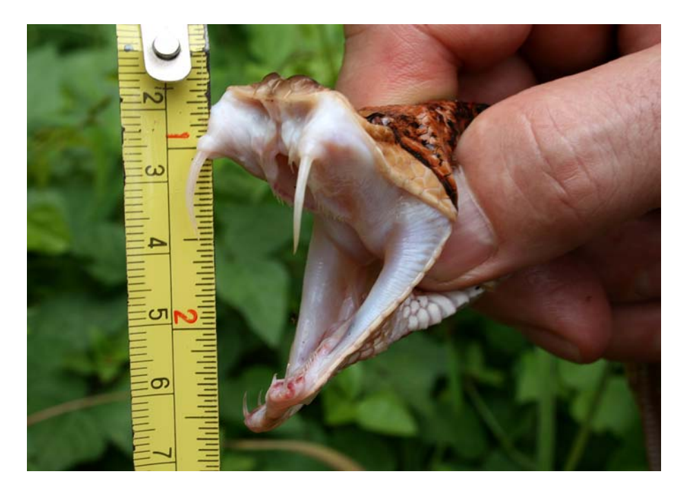
Figure 5. At even 9-months age a bushmaster has enormous fangs! A finger could be pieced through, with intramuscular injection a near certainty in a hand or foot. Photo Regina Ripa. Cape Fear Serpentarium.

He is a fool who injures himself by amassing things. And no one knows why people cannot help but do it. — Danse Macabre